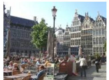
Antwerp, Grote Market