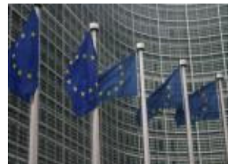
Europe Commission in Brussels

Welcome dinner and overnight in Brussels