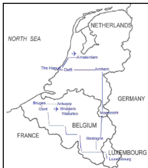
„Flowers, Windmills and Museums“